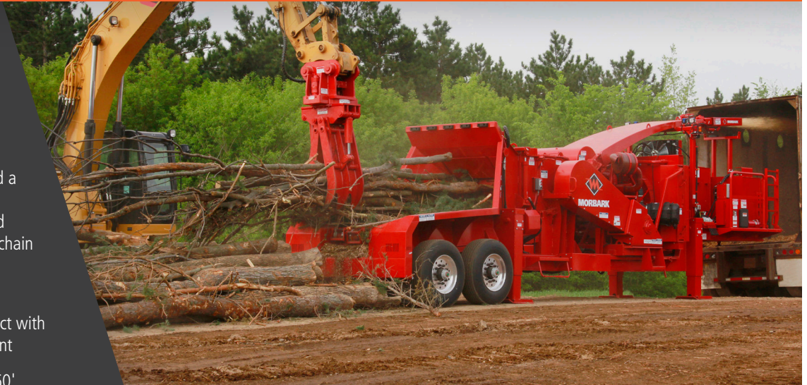
Aggressive, sloped live floor and large top feedwheel